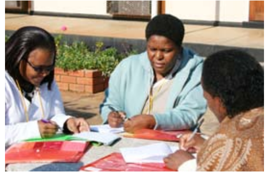
Healthcare workers came from all over South Africa to take part in the training.

The 9th international training of facilitators in the ethos of VIHASA took place in collaboration with the Values in Healthcare Association of South Africa, in May 2008, in the picturesque mountainous region of Drakensberg, a three-hour drive from Durban.