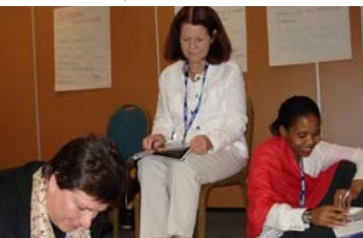
Below: Summer workshops participants reflect on the value of co-operation.

a loving and nurturing way. This is a difficult concept to hang on to in healthcare as all of our training gears us to look after others. This workshop helped me to understand myself better and taught me how to look after both myself and my clients. One of the biggest learning points for me is how to deal with mistakes and how to learn from them.