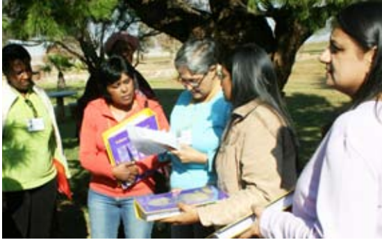
Values in Healthcare market-place: delegates purchase packs and discuss future training plans.