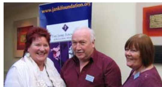
JF exhibition at the conference Reviving the Spirit Within Palliative Care Practice , Strathcarron Hospice – volunteers manned the stand.

Importance of spending time with a patient and not just focusing on physical symptoms.