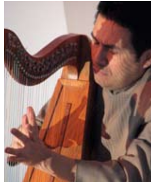
Musical interludes on the harpsichord created space for reflection.

• patient recovery rates, when they are listened to and their spiritual needs attended to, may improve but these improvements are not yet quantified or statistically verified.