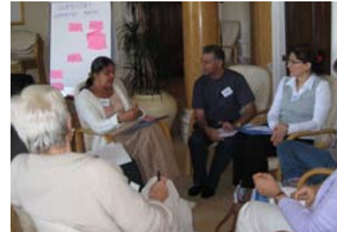
Oxford: Advanced facilitators discuss and exchange.