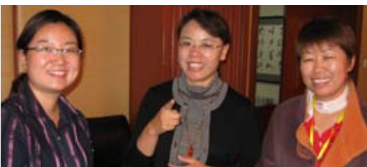
Above right, above and below: China delegates take pride in creative expression of their values for healthcare and enjoy sharing and networking.