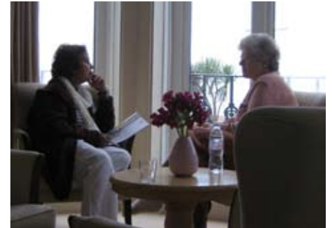
Worthing: New facilitators in silent contemplation.

It was run as a single group with two core trainers. Their comments reflected that they enjoyed partaking in the ethos of the adult learning community and felt the training equipped them to provide better care and improve communication and collaboration with colleagues!