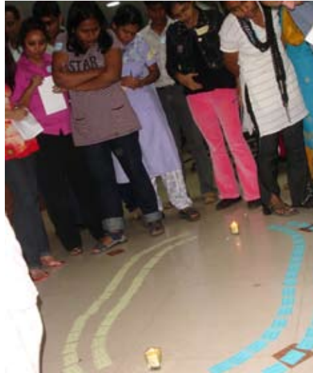
Encircled closure: the group concluded with a candle-lit pause to honour shared values and new learning, Mumbai.

In January 2009, a VIHASA workshop was arranged for the attendees of a surgical conference, on Mt Abu, Rajasthan, India. This followed a successful workshop on values held in Mumbai in the autumn, at Reliance Energy Management Institute for 30 participants. It was facilitated by staff from BSES Municipal General Hospital and most participants reported it to be a stimulating experience: