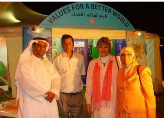
Oman: A Values in Healthcare exhibition took place at the Muscat Festival in January 2009 under the broader theme of Values for a Better World .